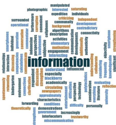
Figure 3. Word Cloud by NVivo 12 Plus For MacBook

In the overall analysis, the effective use of information and the role of digital literacy in strengthening civic participation among digital natives can be linked to achieving a utopian vision. By harnessing the positive potential of social media, collaboration in solving problems, and good privacy policies, digital natives can contribute to building a better society closer to the image of the utopia they desire. The analysis conducted on the words that appear frequently in the word cloud shows that the word "information" has a significant presence in the context of this study. This reflects the important role of information in digital literacy and citizenship participation among digital natives.